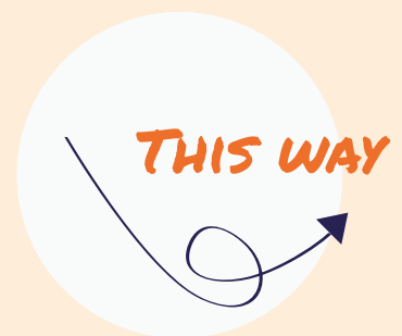
CIRCULATION FLOW INDICATED TO FACILITATE DISTANCING