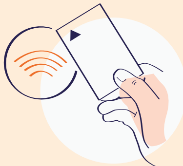
CONTACTLESS SERVICES AND DIGITAL TOOLS FOR SAFE EXCHANGE