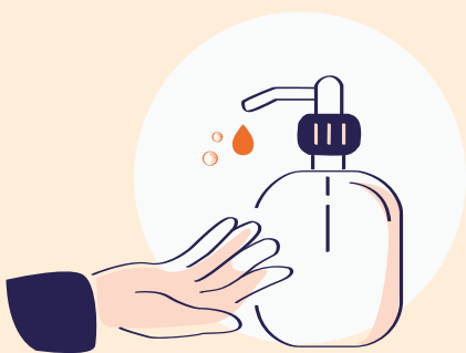
HAND SANITIZERS PROVIDED AT EVERY ENTRANCE