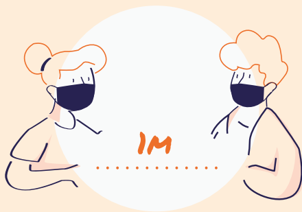
SOCIAL DISTANCING ENFORCED IN ALL AREAS

IMCAS is implementing the following sanitary regulations to prevent the spread of Covid-19