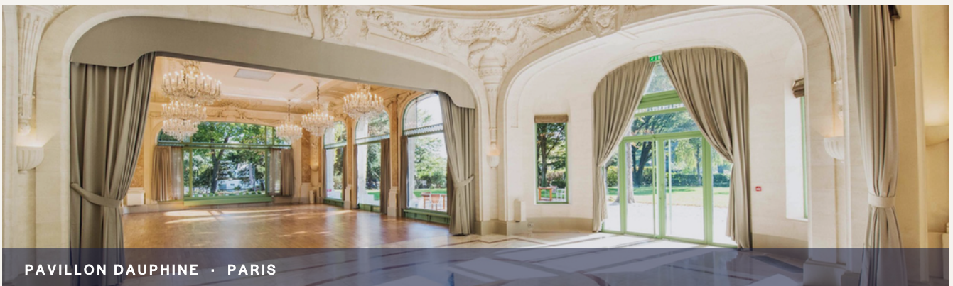
PAVILLON DAUPHINE · PARIS

To move beyond traditional networking and facilitate high-level M&A, strategic alliances, and capital deployment.