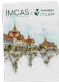
IMCAS ASIA JUNE 17 TO 19, 2022 BANGKOK & ONLINE