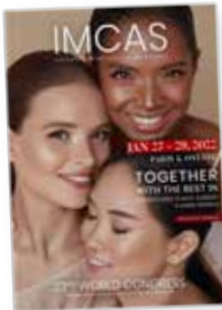
IMCAS WORLD CONGRESS JANUARY 27 TO 29, 2022 PARIS & ONLINE