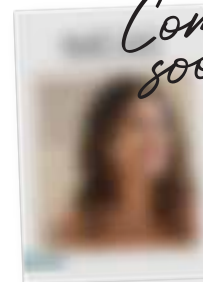
IMCAS AMERICAS SUMMER 2022 CARTAGENA & ONLINE